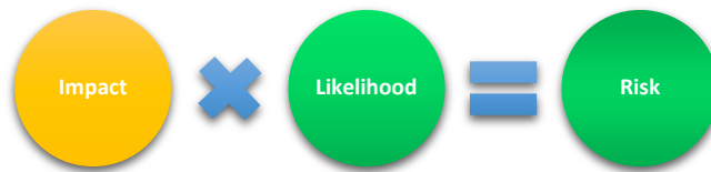
FIGURE 2 – RISK EQUATION

Impact and Likelihood are assigned severity ratings based on the analysis and risk is determined using the following table.